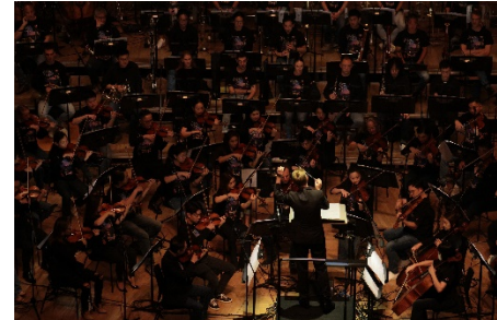
Hong Kong Philharmonic Orchestra