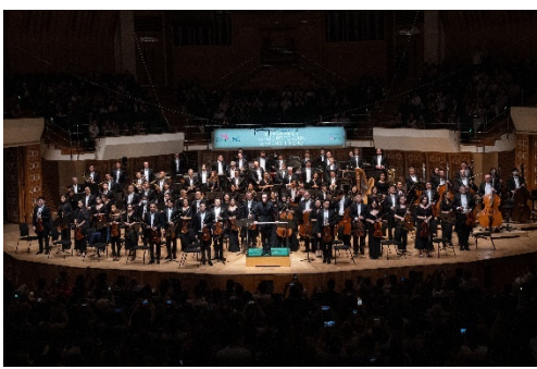
Hong Kong Philharmonic Orchestra