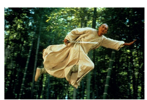
Crouching Tiger, Hidden Dragon © 2000 United China Vision Incorporated for the World Excluding the United States and Canada and their Respective Territories and Possessions.