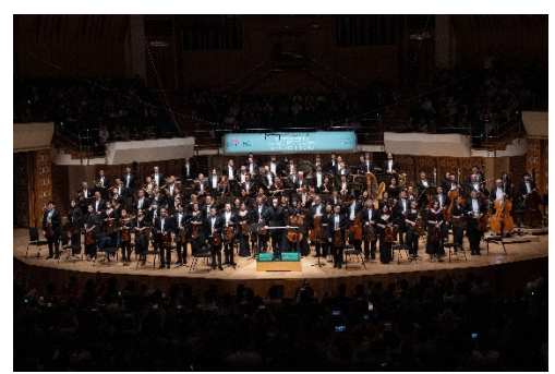
Hong Kong Philharmonic Orchestra