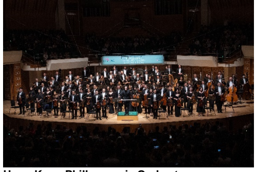
Hong Kong Philharmonic Orchestra